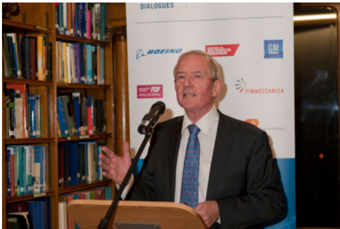
Barry Sheerman MP addressing the meeting

On 6 December, at an event in the grand surroundings of the Institute of Mechanical Engineers, there was a palpable sense of optimism. The gathering consisted of representatives from some of Britain's leading manufacturing companies and around thirty parliamentarians from both the Lords and Commons. They had gathered to hear the conclusions of a year long research programme culminating in the report 'Manufacturing a Greater Britain'.